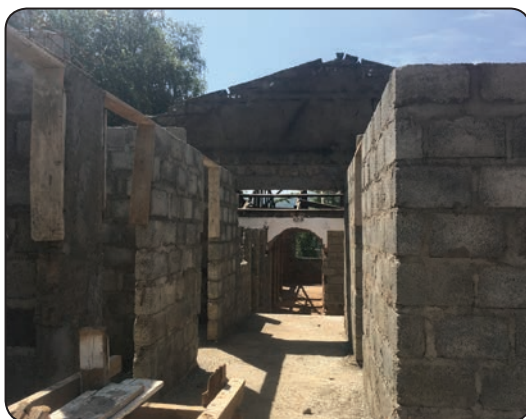
Repairs and renovations underway at the Bomet Annex – March 2017

To make a gift, please visit www.friendsoftenwek.org/donate . On the donation drop down menu for "Please Use This Gift" choose Bomet Annex designate your gift.